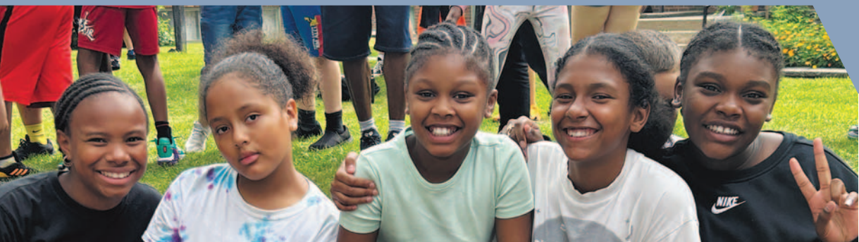
Tyndale St-Georges Community Centre in Montreal.

780 congregations 102,000 members and adherents 1,254 ministers 11,000 children and youth