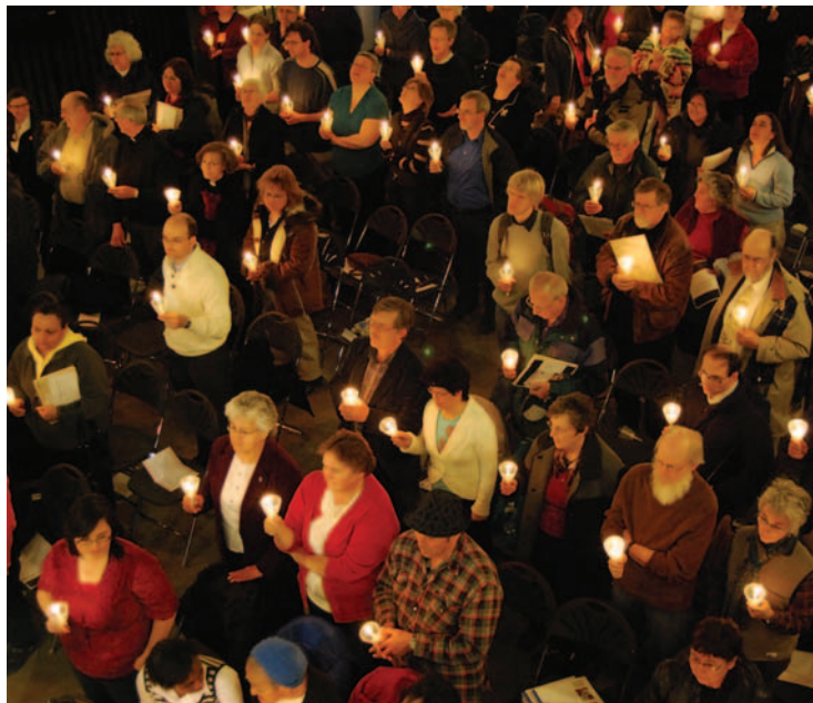
Vigil for children who attended residential schools. Winnipeg, MB.

“Christians cannot eat and drink at the table—where all are welcome and none goes hungry or thirsty—and continue to condone any form of discrimination or any social or economic policy that results in hunger or other forms of deprivation.”