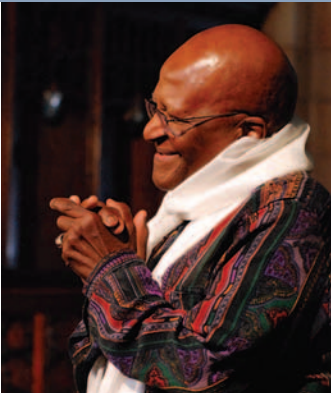
The 1993 Cutting Edge of Mission Award Recipient: Archbishop Desmond Mpilo Tutu, President of the ALL Africa Conference of Churches; Nobel Laureate.

The church is sent to engage in God's revolutionary mission, which requires it to listen for prophetic voices and be on the cutting edge: responding with risky love, creative imagination, and decision-making without precedent. Truth-telling, peace-seeking, and reconciling relationships are all signs of the good news of God at work in the church and world. The Presbyterian Church in Canada is strengthened by learning from people with a prophetic vision and a message of hope.