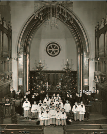
Choir at the Presbyterian Church of St. David, Halifax, NS at Christmas. [1949]

“Fear not...You will find a baby wrapped in cloths and lying in a manger...” The angel’s message first came to troubled people and places and it continually comes to us again as a reminder that God came into the world in human form in all its frailty, and we cannot remain the same.