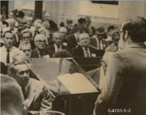
Commissioners listen to a Young Adult Observer appeal for an increase in the stipends of deaconesses at General Assembly in Halifax, NS. [1970] More details in the Presbyterian Connection Summer 2024 issue Remarkable Moments: Young Adult Observers .

The church is called to be together, to learn together, to make decisions together, to listen to one another and to new voices as we discern the mind of Christ and the things God is doing. We believe that through such communal activity, subject to the Word of God and inspiration of the Spirit, the discernment we do together is better than the decisions any one of us would make alone.