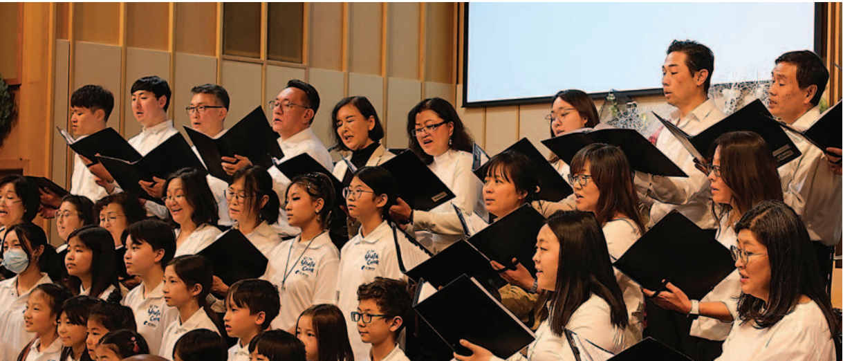
A service of repentance, healing and hope.

Our mission, in a world of many nations, peoples, denominations and faiths, is to learn from one another and work together for the healing of the nations.