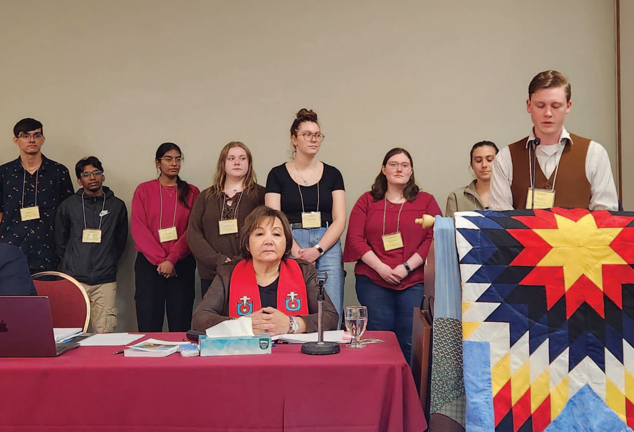
Young Adult Representatives addressing the General Assembly in Halifax, NS. [2023]